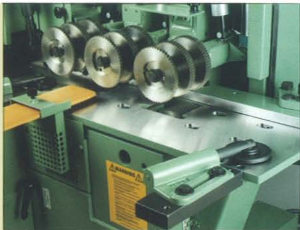
Driven infeed bed roller pneumatically linked to top driven feed roller, for ultimate control of wet and awkward timber.